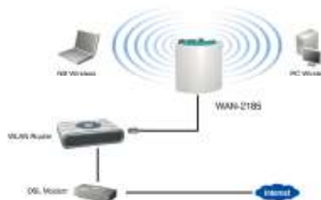
Operated in AP Mode