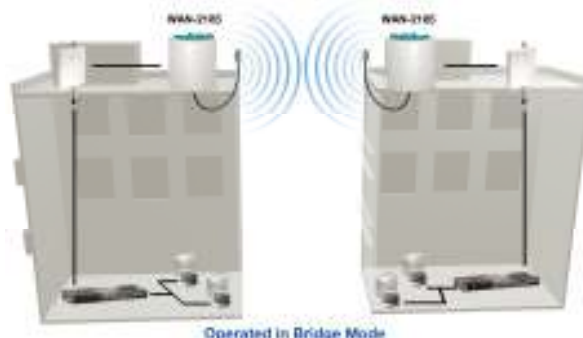
Operated in Bridge Mode