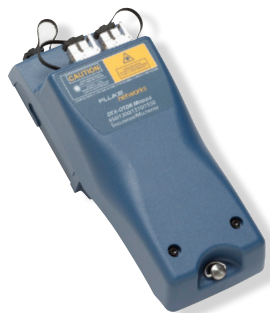
DTX Compact OTDR module